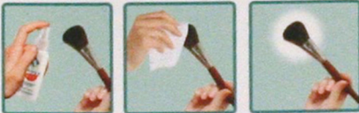
SPRAY ON BRUSH OFF DRIES FAST

DIRECTIONS: Simply spray lightly onto your makeup brush. Use a tissue and brush it off. Repeat as needed.